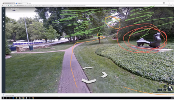
Figure 3. C4I discusses the design of a park. He sketches over a Google Earth screenshare as deictic gesture to ground his description.