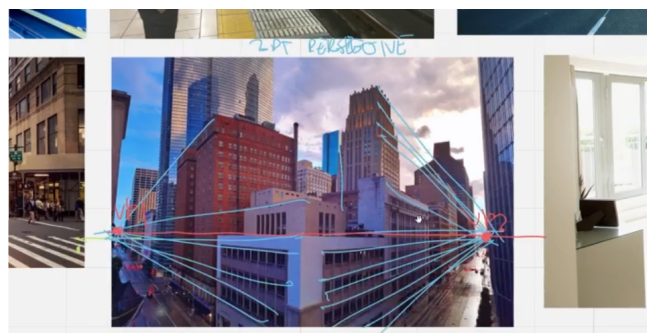
Figure 2. Prior to presenting his tutorial, C3I collected photographs and drawings exemplifying perspective. During the tutorial, he sketched over these images to illustrate perspective drawing techniques.

In each probed situation, participants worked to create curation spaces before the actual live engagement. Participants, students in C1 and C2 and instructors in C3 and C4, collected media, wrote text, sketched, and assembled curations prior to each activity. For example, prior to his tutorial, C3I collected